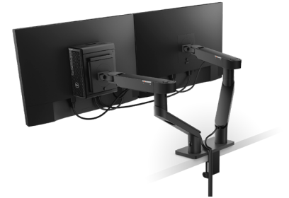
PRECISION COMPACT DUAL VESA MOUNT

The monitor stand mount allows the Precision 3240 Compact to be firmly mounted behind select stands and monitors, as shown above (mounted on back of P2720DC monitor).